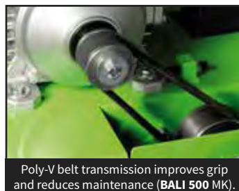
Poly-V belt transmission improves grip and reduces maintenance ( BALI 500 MK ).