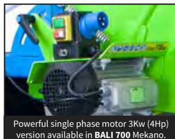
Powerful single phase motor 3Kw (4Hp) version available in BALI 700 Mekano.