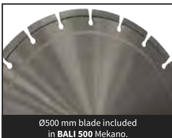
Ø500 mm blade included in BALI 500 Mekano.