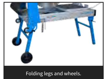
Folding legs and wheels.