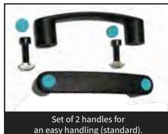
Set of 2 handles for an easy handling (standard).