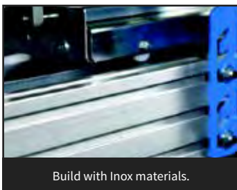
Build with Inox materials.