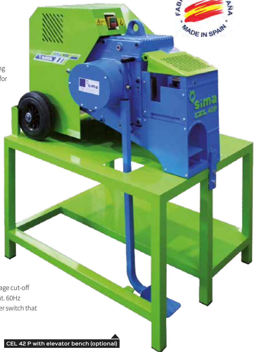
CEL 42 P with elevator bench (optional)