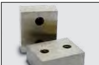
Interchangeable 4 faced long life cutting blades (set of 2 pcs.).