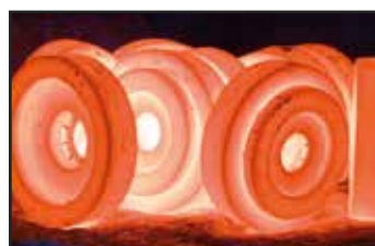
Inner components tempered for extended working life.