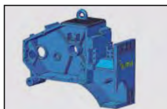
Heavy cast-iron monoblock chassis.