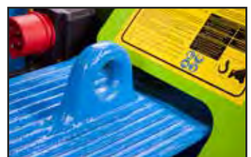
Lifting hook for easy transportation and shifting.