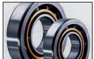
High end quality bearings.