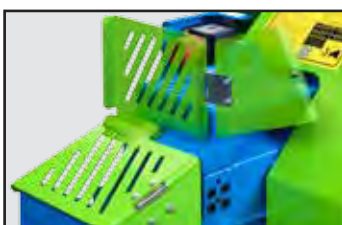
Safety shield, fast and easy to use.