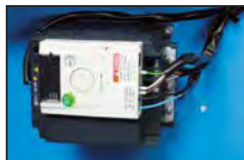
Inverter equipped (Single-phase). Reduced noise operation.