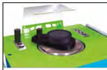
Large diameter rebars bending kit (optional).