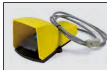
Safety foot pedal control.