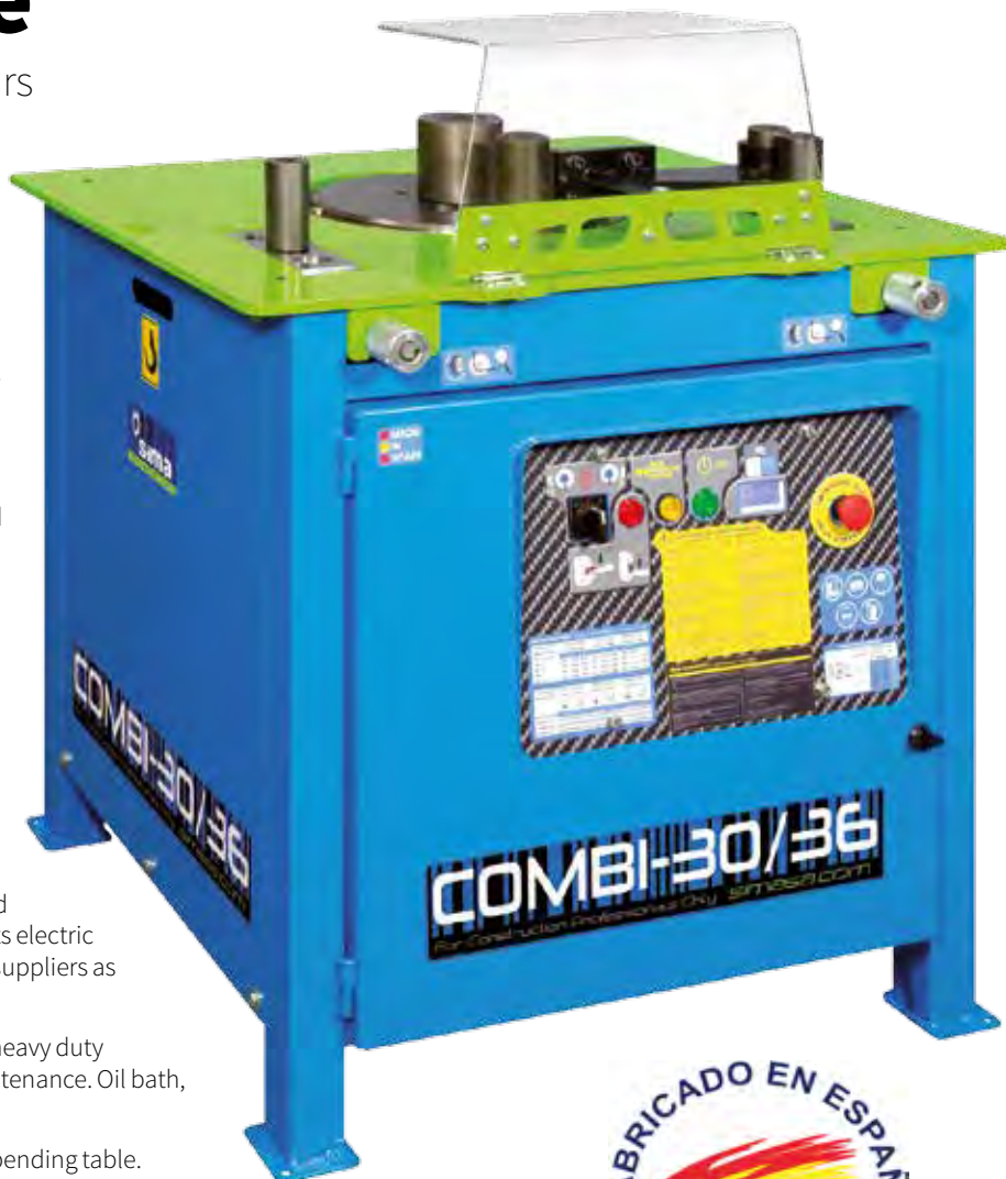
COMBI 30 - 36