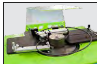
Spirals / hoops bending accessory (optional).